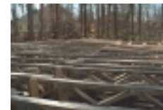
Truss joist systems require approved truss plan on site.