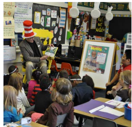
Williamsburg Mayor Clyde Haulman reading to Matthew Whaley students

The city's school population, for purposes of apportioning cost between the city and the county as determined by September 30, 2012 enrollment, is 902 , or 8.55% of the total.